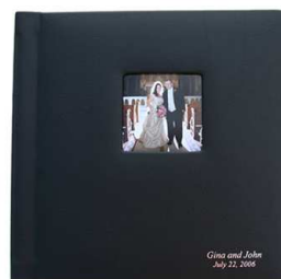
SMALL CAMEO COVERS AVAILABLE