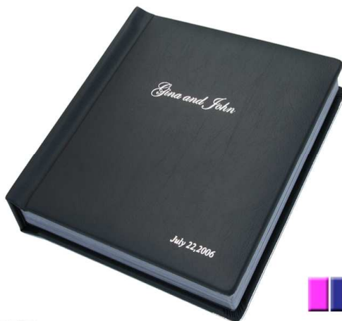
GOLD OR SILVER EMBOSSING