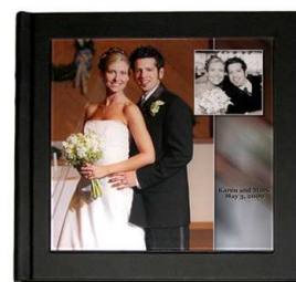
LARGE CAMEO COVERS WITH ACRYLIC AVAILABLE