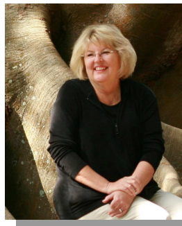
Exhibit of BPPA Work being Planned