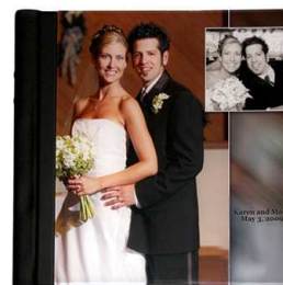
FULL ACRYLIC AVAILABLE